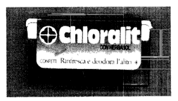
Respondent-Applicant's CHLORALIT (Exhibit "U")

As shown by the marks, Opposer's "CLORETS" contained a cross design below and the word CLORETS is written in green color while Respondent-Applicant mark "CHLORALIT" is written in white with green background.